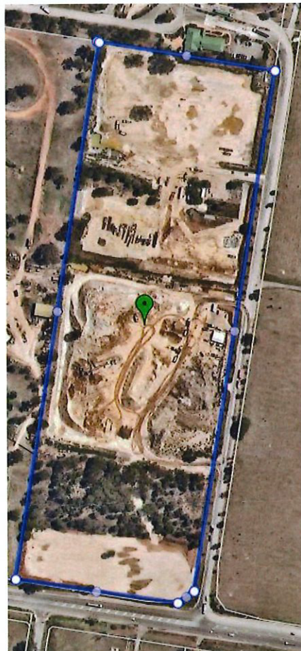
Figure 2: Aerial image of the subject property as at 22 January 2020

The subject property is cleared of vegetation with the exception of an area of shrubs and trees towards the southern portion of the site. This vegetated area does not form a connection with vegetation on adjoining properties, and is bisected by an unsealed vehicular track. An aerial photograph of the subject property is below at Figure 2 .