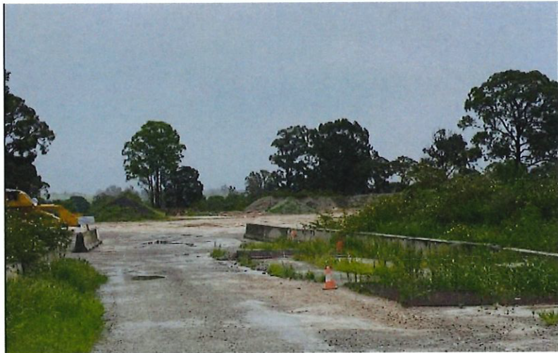
Figure 3: Photographs taken on 14 February 2020

The following development consents have been granted with respect to the subject property: