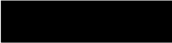
Photo 1: Image taken near corner of Elizabeth Drive and unnamed road.