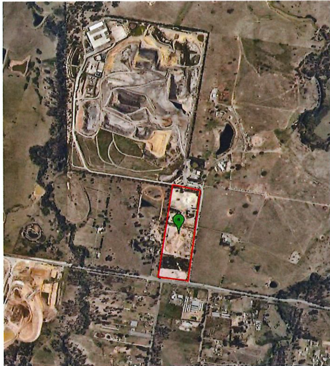
Figure 4: Aerial image of site and surrounds as at 22 January 2020